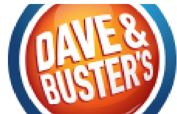
Dave & Busters coming to Milford