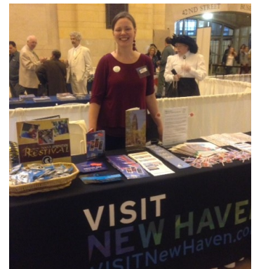
American Bus Association Tradeshow